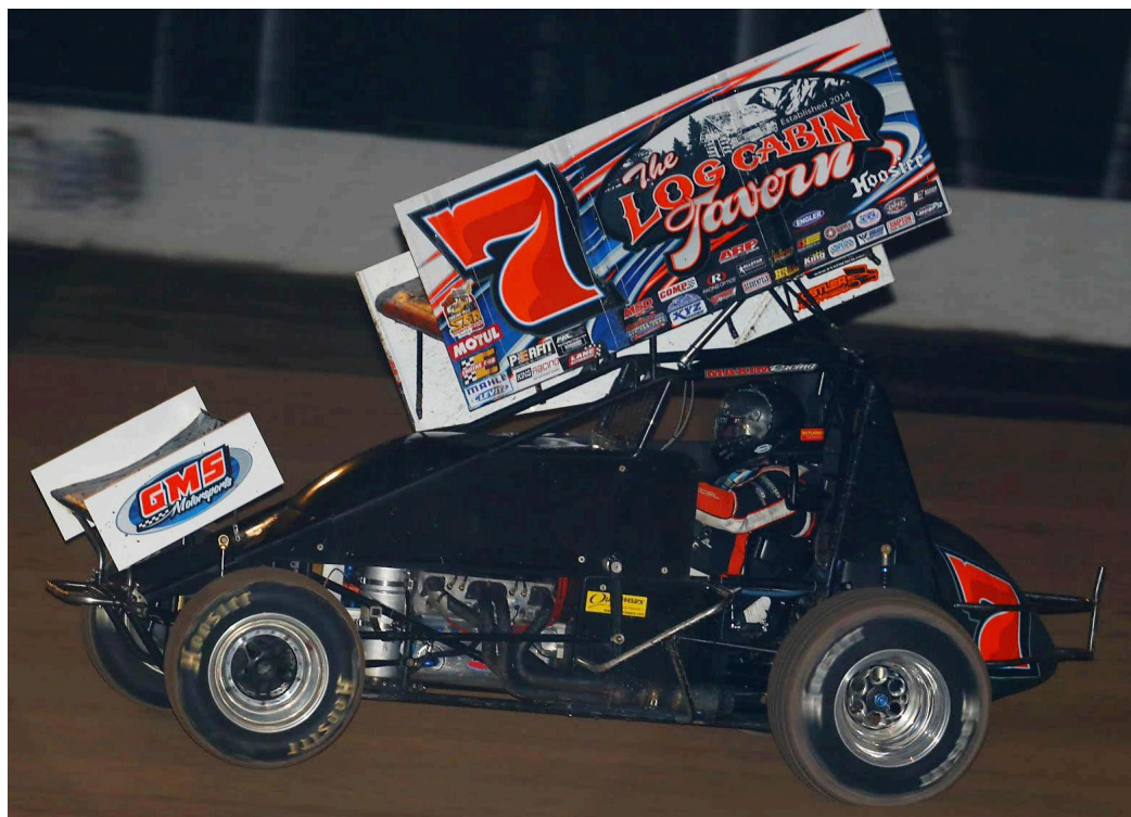
Johnny B Imagery