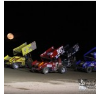
Feature lined up at Crystal.