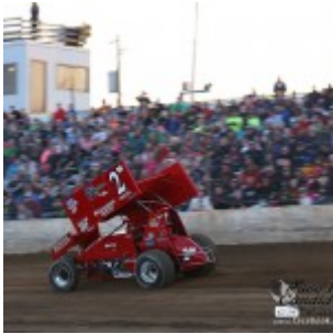
Dustin Daggett in front of a full house at Crystal Motor Speedway.