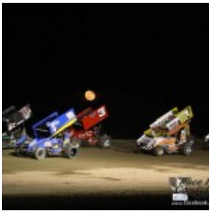
Feature starts to form up at Crystal.