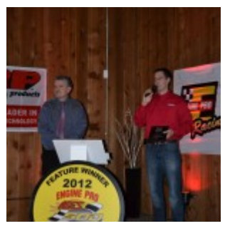
Tri-City Motor Speedway accepting the track of the year. Tri-City Motor Speedway accepting the track of the year award.